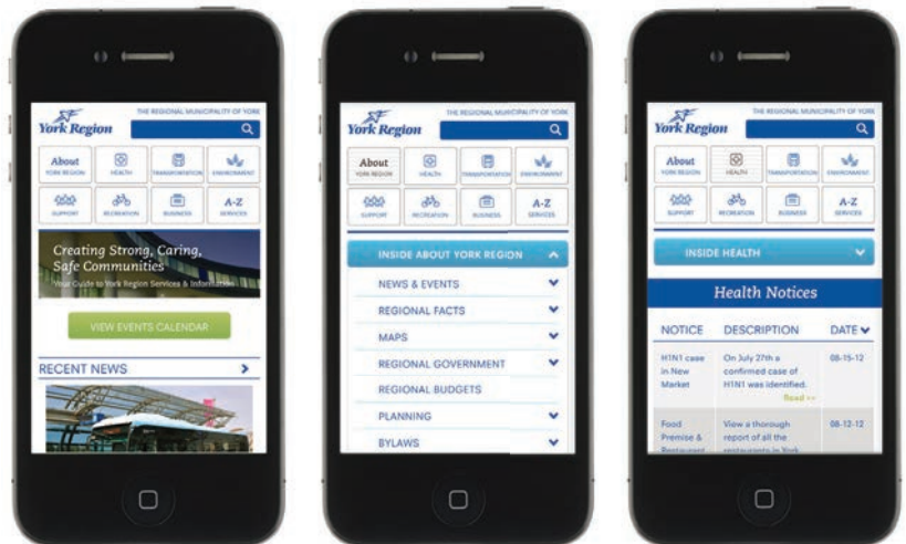
Mobile Website example

LONDON Kemp House 152-160 City Road London, UK EC1V 2NX T: +44 (0)20 3598 2601