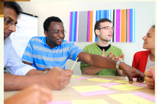
Focus group in progress